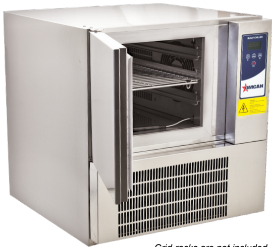
Grid-racks are not included.